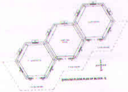
GROUND FLOOR PLAN OF BLOCK-1