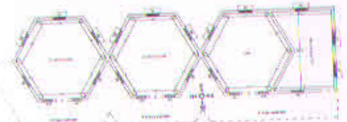
GROUND FLOOR PLAN OF BLOCK-3