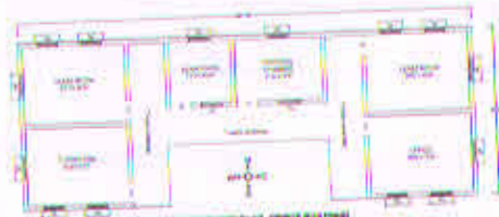
GROUND FLOOR PLAN OFFICE BUILDING