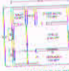
GROUND FLOOR PLAN OF SMALL BUILDING