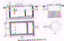
GROUND FLOOR PLAN OF SMALL BUILDING